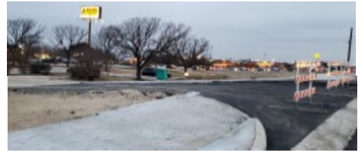
Pave Chuys and Cracker Barrel Driveway