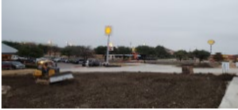
Place Topsoil for Seeding at Rudy's and Mellow Mushroom