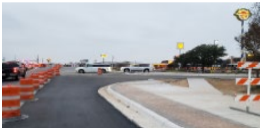
Pave Wolle Lane