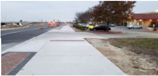
Complete Denny's Driveway, Share Used Path and Ramps