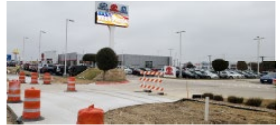
Pour and Finish Toyota/Honda Driveway