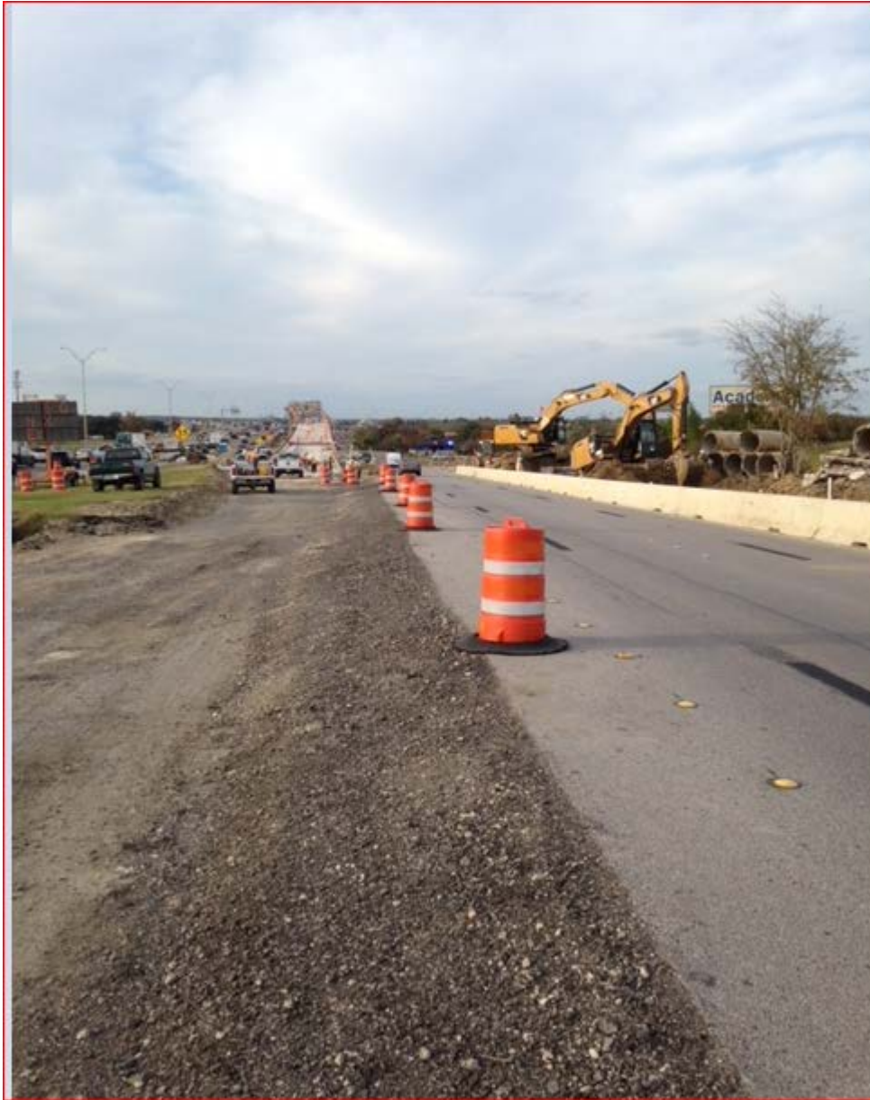
Ramp 21 approach