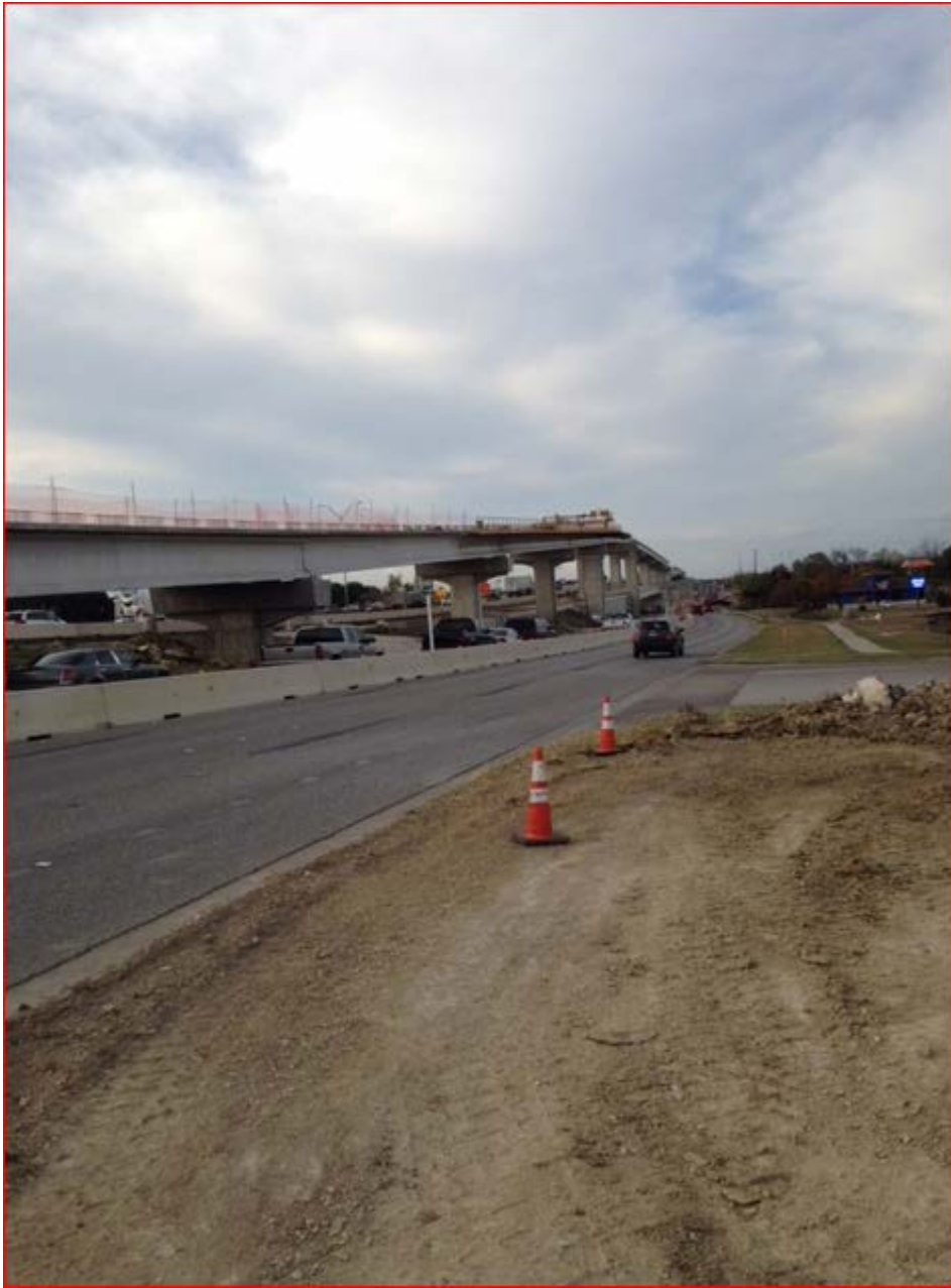
Ramp 21 progress