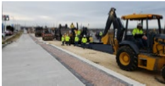
Pave last section of the northbound frontage road