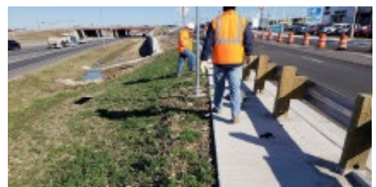
Walk jobsite with owner for punch list