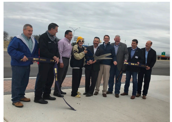
Cut the Ribbon!