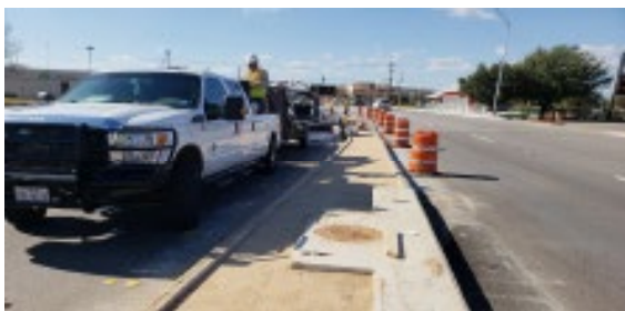
Complete paver work in center island