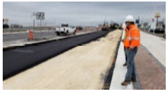
Pave last section of northbound frontage road