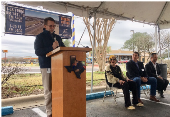
Attend Ribbon Cutting Ceremony with TxDOT and Elected Officials