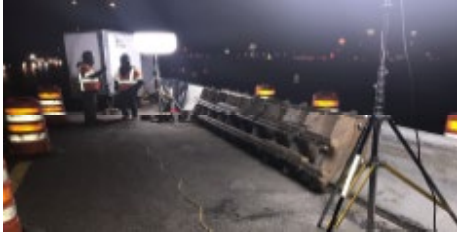
Perform emergency repair of I-35 mainlane barrier