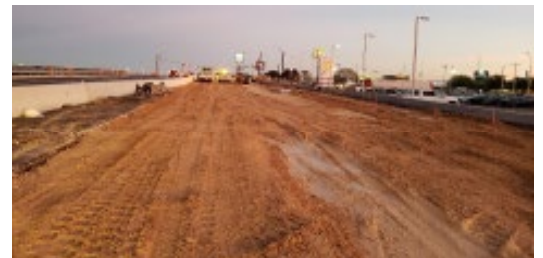
Dewater job-site and recover grade