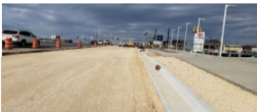
Prep flexbase for final asphalt paving