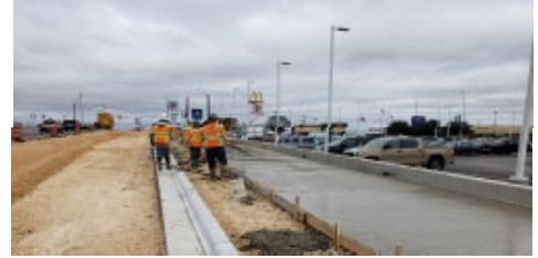
Pour and finish shared used path at Toyota