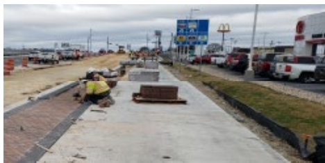
Finish landscape pavers at Toyota