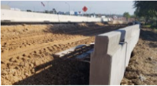
FCI: Pour Pedestrian Rail and Backfill Wall