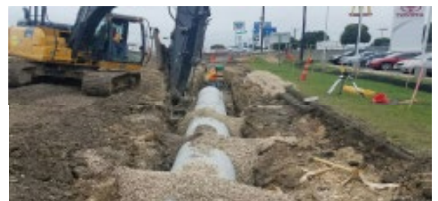
FCI: Storm Sewer Work Along Frontage Roads