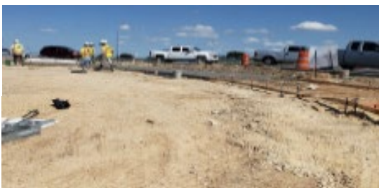
AARON: Place Shared Used Path