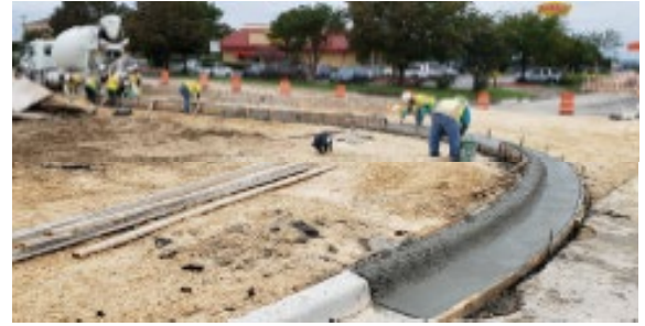
AARON Concrete: Place Curb and Gutter