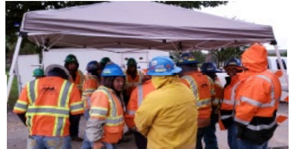
FCI: Discuss Vehicle Damage Policy at Toolbos Talk