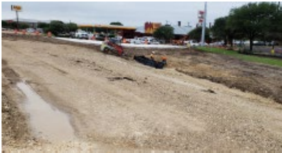
FCI: Dewatering/Dressing slopes/SWPPP